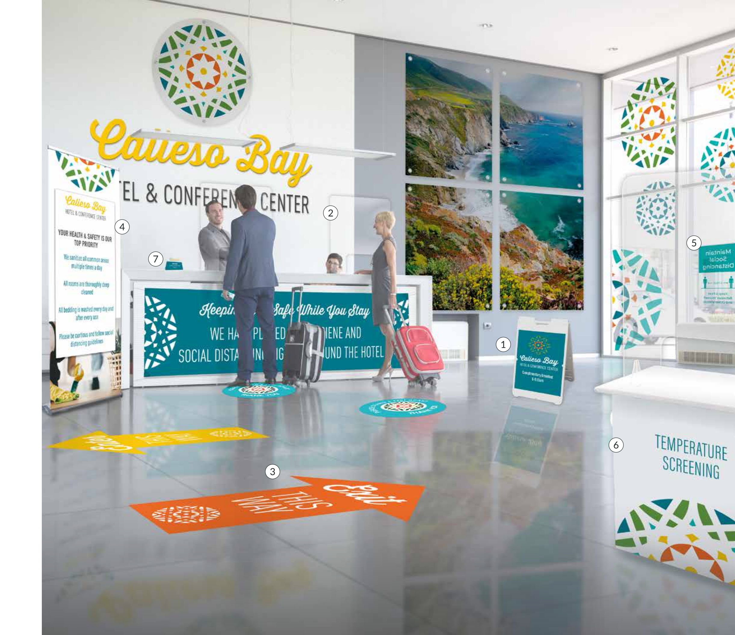
Table tents let you share important messages where they're needed most.